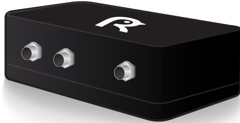
① Factbird® DUO